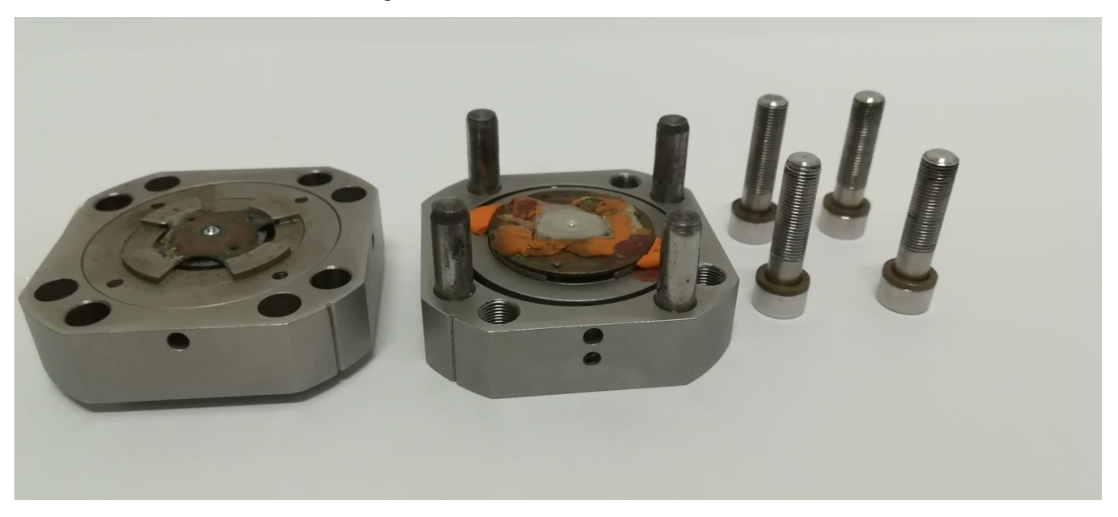
Fig. 2 - Components of an ETH-type diamond anvil cell with the four screws used to load to the diamonds