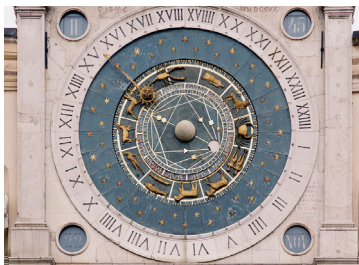
Astronomical Clock of Padova, XV century (Torre dell'Orologio)

October 15 th , 2024 March 15 th , 2025 May 15 th , 2025 May 30 th , 2025 June 15 th , 2025