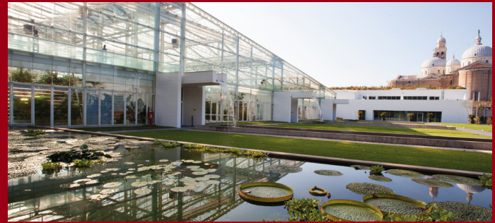
Botanical Garden, Biodiversity Garden