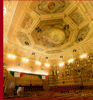
Bo Palace, Aula Magna

The University of Padova is one of the oldest European seats of learning. The Studium Patavinum was founded in 1222 and it shortly became a symbolic place of freedom and internationalization – “ Universa Universis Patavina Libertas ” – open to students and scholars from all over Europe.