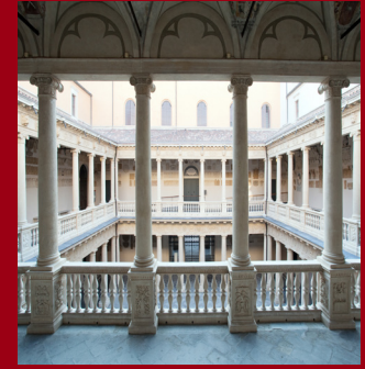
Bo Palace, Old Courtyard